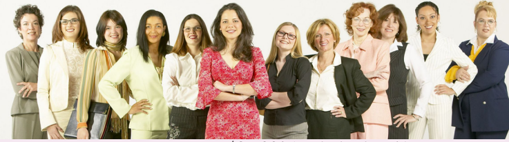
Registration Fee $25.00! (includes lunch)

TUESDAY, JANUARY 26, 2010 • 11:30 AM - 1:00 PM Nessmith-Lane Continuing Education Building, Statesboro, GA