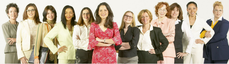
Registration Fee $25.00! (includes lunch)

TUESDAY, JANUARY 26, 2010 • 11:30 AM - 1:00 PM Nessmith-Lane Continuing Education Building, Statesboro, GA