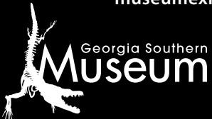
Exhibit Website: www.ProtestToPeace.org